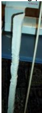
Hug over PVC