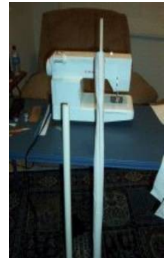
until completely turned &